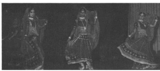
Folk and classical dances of India were presented as part of the cultural program.